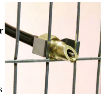
A102 valve & A108 valve clip

The superior quality and versatility of the Edstrom Flex Tube System mean it can tackle almost any small-animal automatic watering needs. Edstrom valves and accessory components make do-it-yourself installation simple and practical. For water supply , use an A225 Filter and Pressure Control Kit, an A204 or A604 Regulator, or an A203 Float Valve Tank. Run a distribution line to your cages and mount a pipe section so the valves are slightly above standing height for the animal (8 to 9" above floor level for rabbits). Debris in the water supply - rust flakes, scale, silt, etc., is the major cause of valve leakage. For safety, an upstream In-line Water Filter (A206) is recommended.