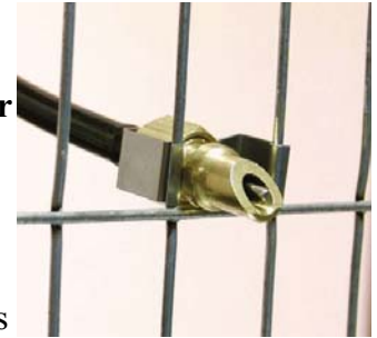
A102 valve & A108 valve clip

The superior quality and versatility of the Edstrom Flex Tube System mean it can tackle almost any small-animal automatic watering needs. Edstrom valves and accessory components make do-it-yourself installation simple and practical. For water supply , use an A225 Filter and Pressure Control Kit, an A204 or A604 Regulator, or an A203 Float Valve Tank. Run a distribution line to your cages and mount a pipe section so the valves are slightly above standing height for the animal (8 to 9" above floor level for rabbits). Debris in the water supply - rust flakes, scale, silt, etc., is the major cause of valve leakage. For safety, an upstream In-line Water Filter (A206) is recommended.