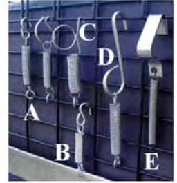
A: Z071 B: ZPS1 C: Z812 D: Z090 E: Z913