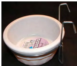
KCS3 with optional holder. Holders available only for only KCS1 and KCS4.