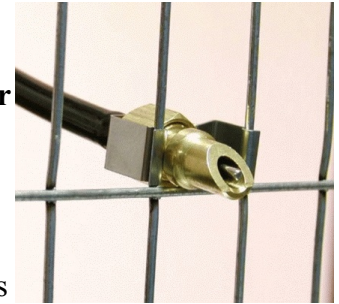
A102 valve & A108 valve clip

The superior quality and versatility of the Edstrom Flex Tube System mean it can tackle almost any small-animal automatic watering needs. Edstrom valves and accessory components make do-it-yourself installation simple and practical. For water supply , use an A225 Filter and Pressure Control Kit, an A204 or A604 Regulator, or an A203 Float Valve Tank. Run a distribution line to your cages and mount a pipe section so the valves are slightly above standing height for the animal (8 to 9" above floor level for rabbits). Debris in the water supply - rust flakes, scale, silt, etc., is the major cause of valve leakage. For safety, an upstream In-line Water Filter (A206) is recommended.