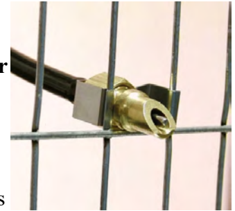
A102 valve & A108 valve clip

The superior quality and versatility of the Edstrom Flex Tube System mean it can tackle almost any small-animal automatic watering needs. Edstrom valves and accessory components make do-it-yourself installation simple and practical. For water supply , use an A225 Filter and Pressure Control Kit, an A204 or A604 Regulator, or an A203 Float Valve Tank. Run a distribution line to your cages and mount a pipe section so the valves are slightly above standing height for the animal (8 to 9" above floor level for rabbits). Debris in the water supply - rust flakes, scale, silt, etc., is the major cause of valve leakage. For safety, an upstream In-line Water Filter (A206) is recommended.