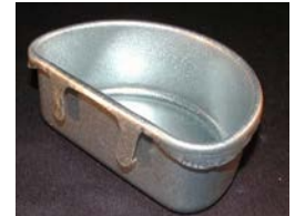
JP20; 3/4 pt Water/feed Pan