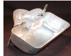
JMW1 Cup & bracket