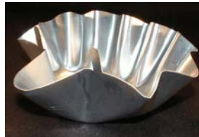
JAL2; 11 oz Standard Cup