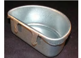
JP20; ¼ pt Water/feed Pan