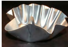
JAL2; 11 oz Standard Cup