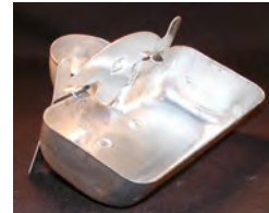
JMW1 Cup & bracket