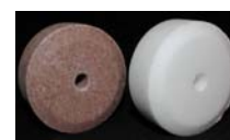
M233 & M232

Very important dietary supplement. Available either in single spools or boxes of 24 spools. Shipping wt. 5 lbs / box.