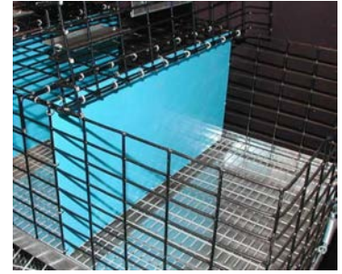
We use Polyethylene Dividers in many of the products we build!