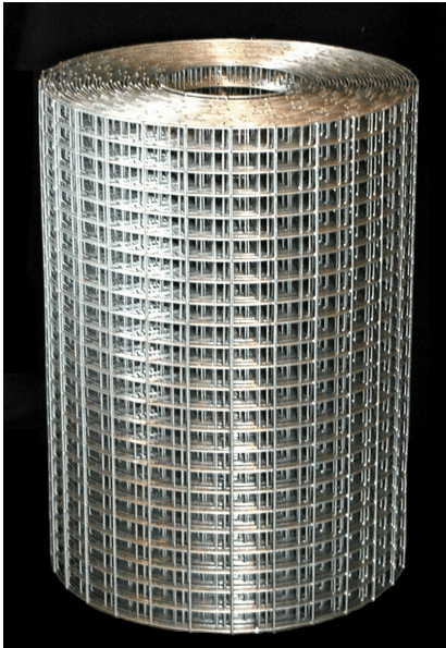
W615 (1" X 2" X 24")