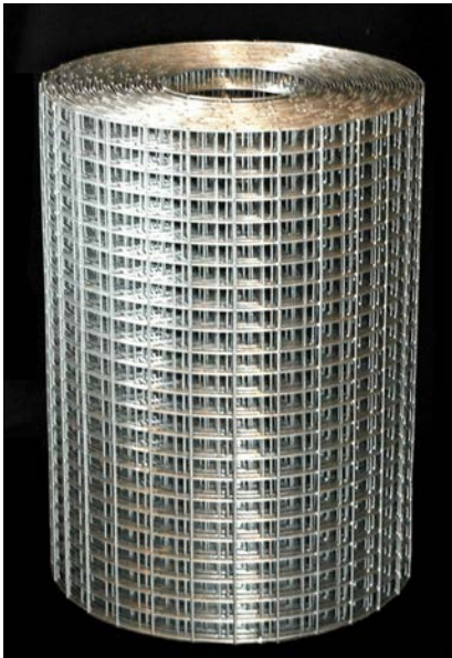
W615 (1" X 2" X 24")