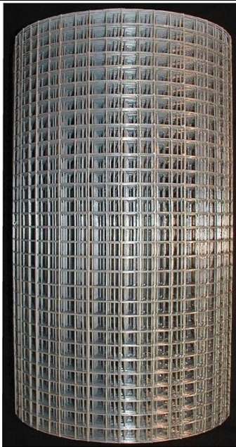
W654 (1" X 2" X 30")